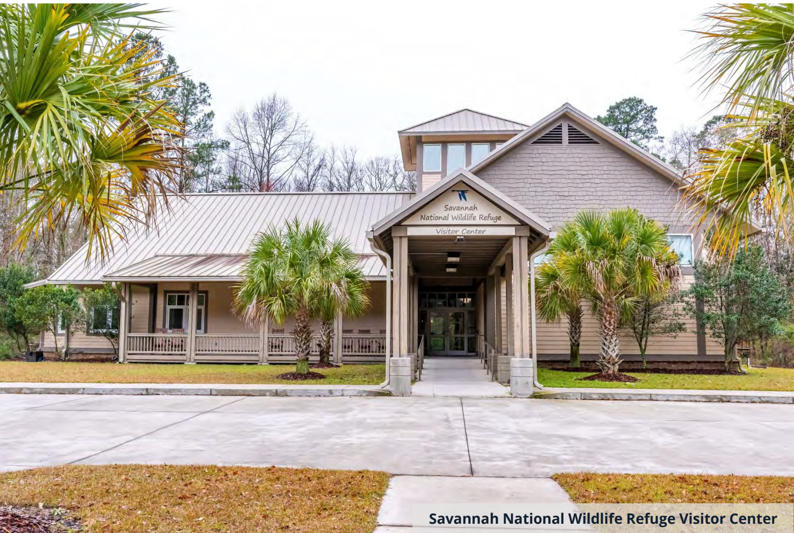
Savannah National Wildlife Refuge Visitor Center

Note: Totals may not foot due to rounding.