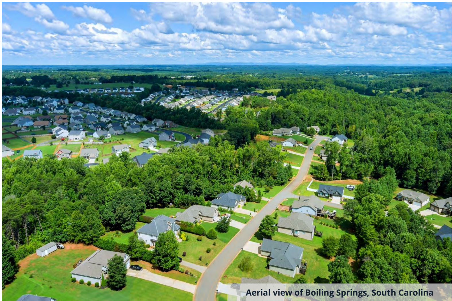
Aerial view of Boiling Springs, South Carolina

Note: Totals may not foot due to rounding.