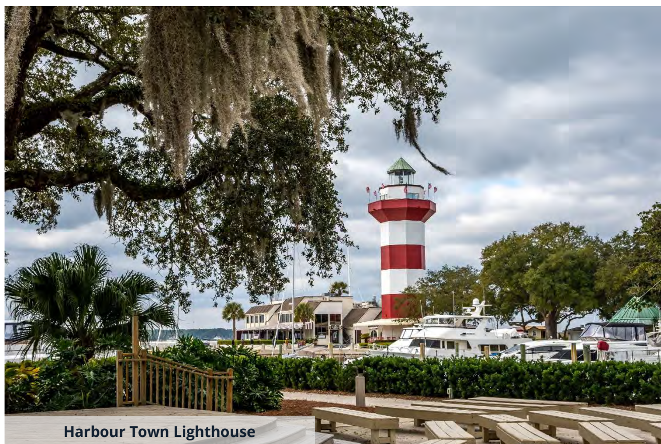
Harbour Town Lighthouse

Note: Totals may not foot due to rounding.