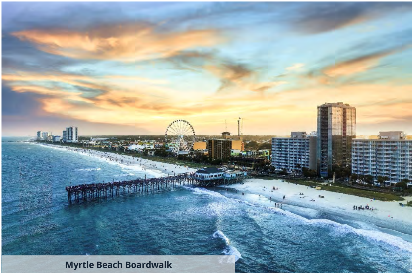
Myrtle Beach Boardwalk

Note: Totals may not foot due to rounding.