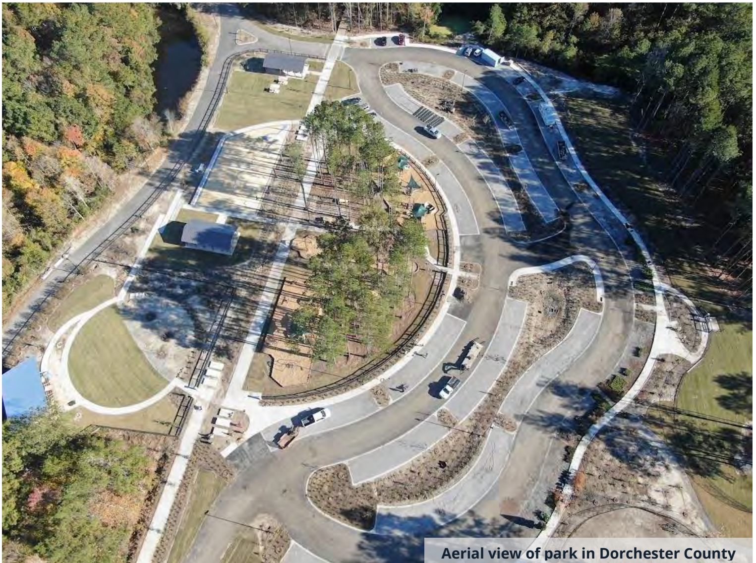
Aerial view of park in Dorchester County

Note: Totals may not foot due to rounding.