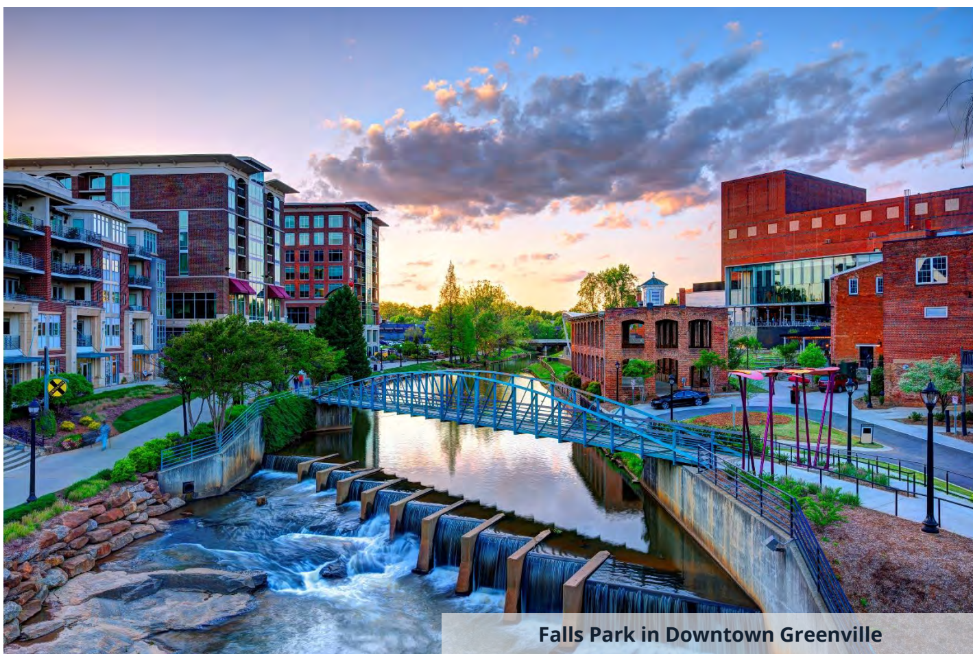
Falls Park in Downtown Greenville

Note: Totals may not foot due to rounding.