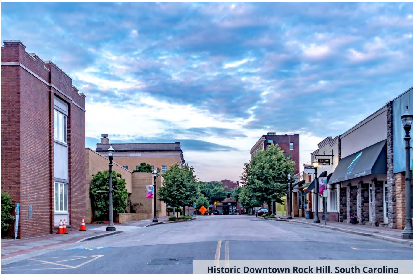
Historic Downtown Rock Hill, South Carolina

Note: Totals may not foot due to rounding.