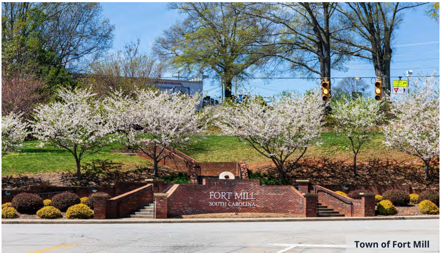
Town of Fort Mill

Note: Totals may not foot due to rounding.